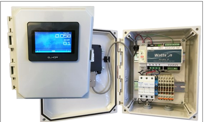
W2KIT-M (-HMI suffix — external touchscreen color HMI)