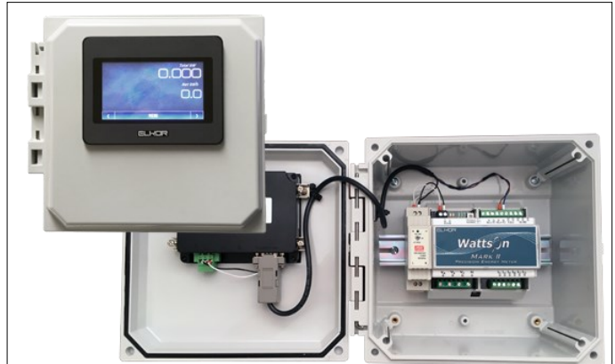
W2KIT-S (-HMI suffix — external touchscreen color HMI)