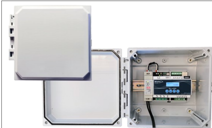
W2KIT-S (-DL suffix — internal display only)